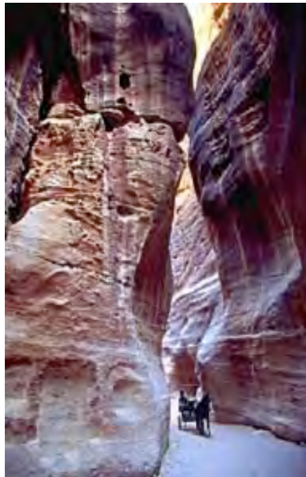
Entrance to Petra

The ancient nations of Edom, Moab and Ammon are all presently located within Jordan. Since Bozrah, (Petra) is located in ancient Edom it is logical for the Jews to flee to this location for safety during the last half of the Tribulation. God will provide Petra for the Jews as a city of refuge outside of the Antichrist’s domain. It will be defensible and located in Mount Seir. As they flee, they will be given food and water, which will be miraculously provided as God did for them in the Exodus.