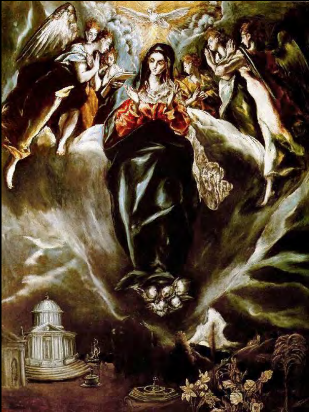
The Immaculate Conception by El Greco Cir 1610