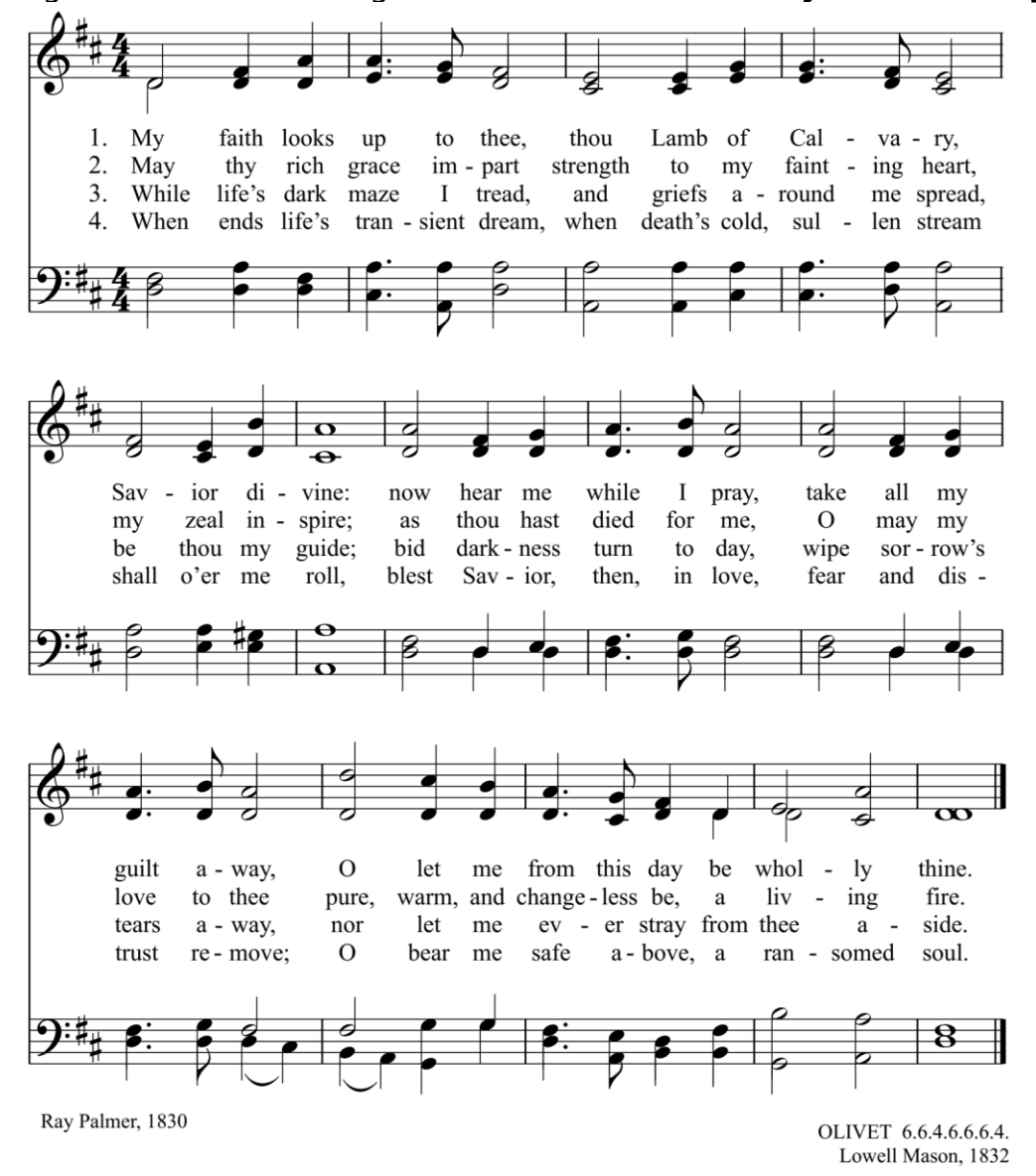
My Faith Looks Up to Thee