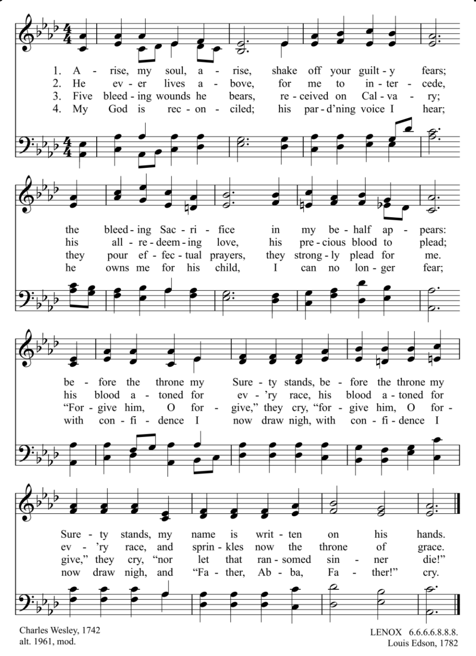
* Continuing Our Praises