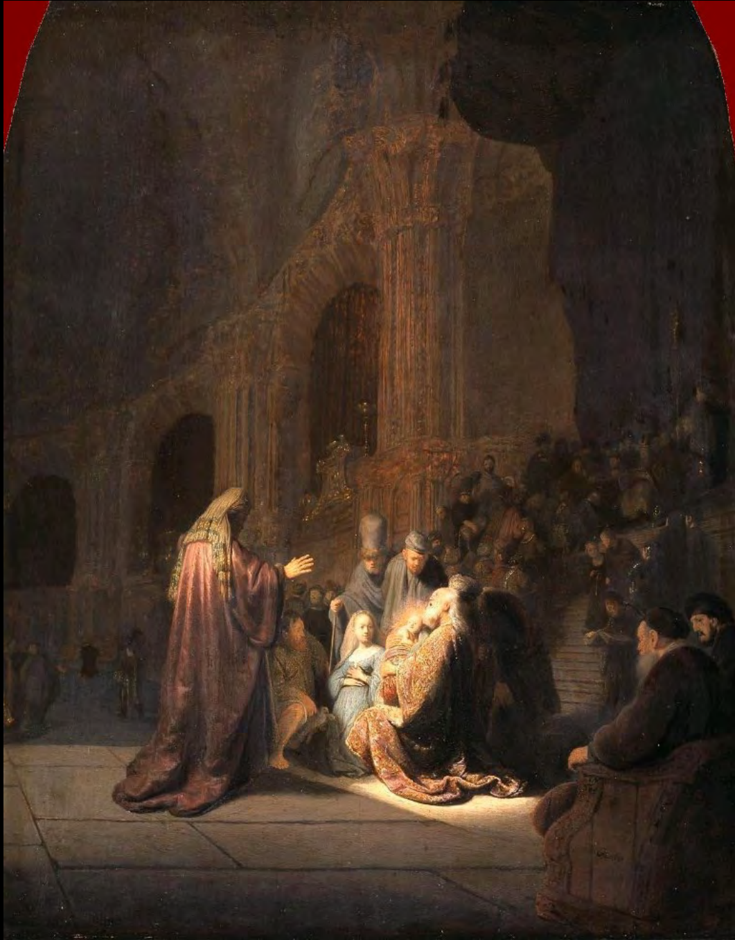
Simeon's Song, A Light To Lighten The Gentiles by Rembrandt Cir 1631