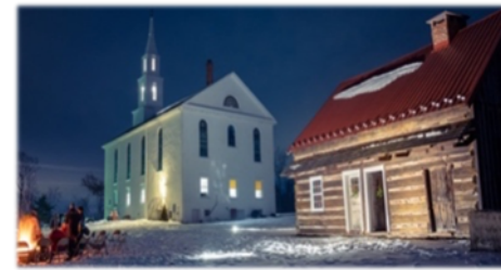
Old Goshenhoppen Reformed Church February 28 th , 2021