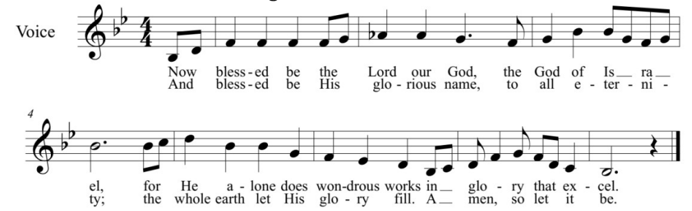
* Please stand if able