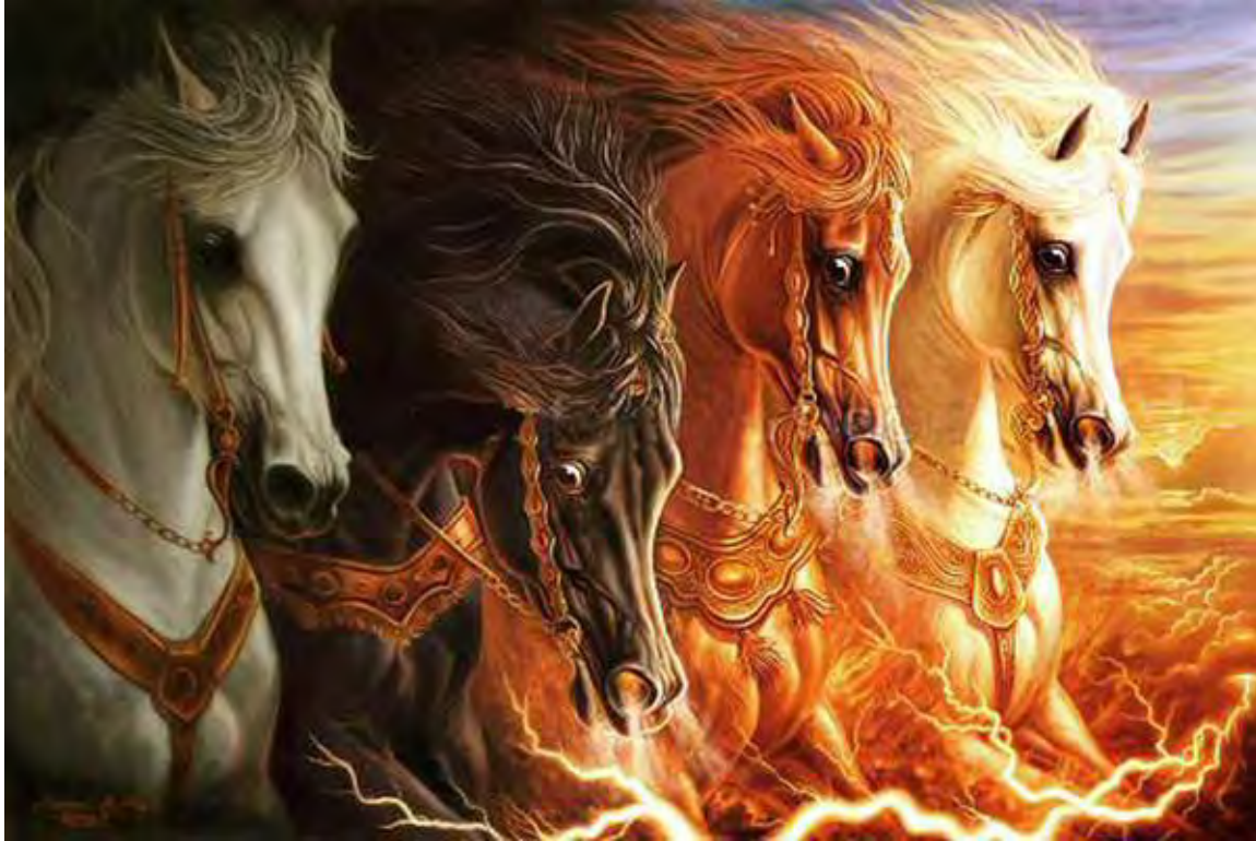
Painting by Sharlene Lindskog-Osorio

THE LORD WILL BRING ISRAEL BACK TO THE LAND & THEY WILL PREVAIL OVER ENEMIES