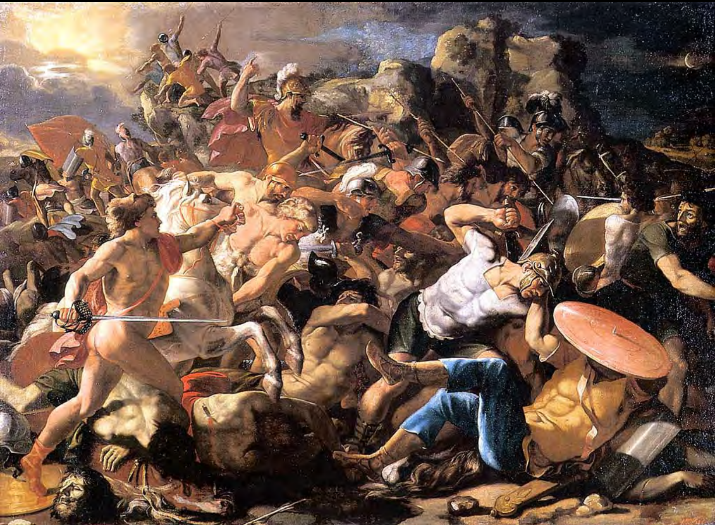
Joshua's Victory over the Amorites by Nicolas Poussin cir. 1624-26

The Lord Will bring Israel Back to the Land October 20, 2013