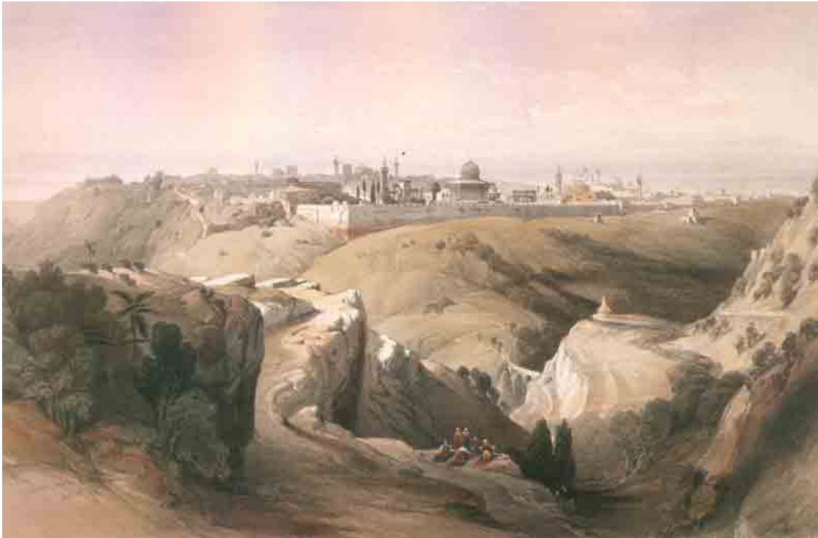
The Valley of Jehoshaphat by David Roberts Cir. 1840