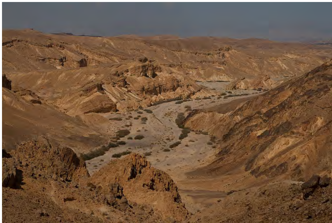
Cir. June 2009

In concert with the vast topographical changes to the earth Zechariah now says that the land of Israel will be made like the Arabah , from Geba to Rimmon south of Jerusalem. The Arabah is the name of the geographical depression or rift that extends from the Sea of Galilee and the Jordan Valley through the Dead Sea to the Gulf of Aqaba. It is 103 miles long very hot and dry and consequently only lightly populated. The verse specifies the southern most section from Jerusalem to the Gulf of Aqaba. Presently this has portions that are the deepest depressions on earth at 652-1300 feet below sea level. So the earthquakes and geographical transformations will result in the Jerusalem region being the highest mountain in the world ( and she shall be lifted up ). The surrounding regions will have the deep depressions setting off Jerusalem as the highest area on earth. King Jesus will have His city, Jerusalem and temple there. The curse of sin will be gone from the earth and Jerusalem will finally be at peace from the occupations carried on throughout the Times of the Gentiles (cir. 586 B.C. – The Second Coming).