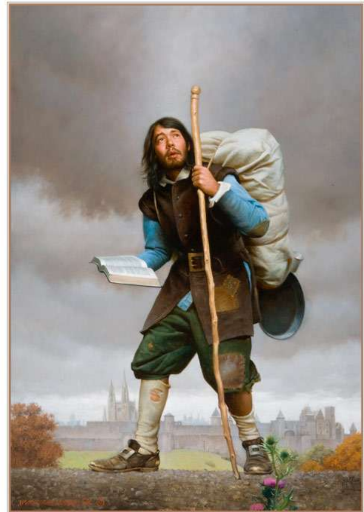
Christian looks for a way of escape outside the City of Destruction.