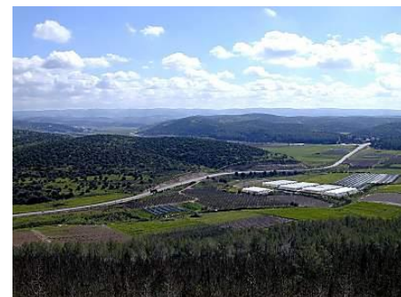
This is a photograph of the valley of Elah where the battle with Goliath took place

Or maybe they are just thinking like the officials of Aram in the time of Ahab.